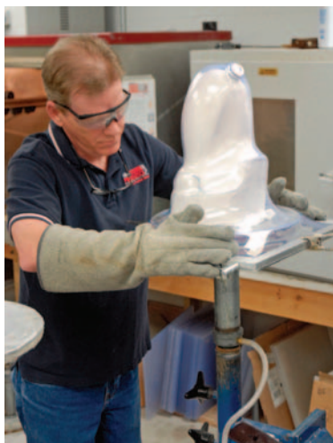
Forming the check socket.